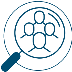
Targeting Consumers Willing to Donate